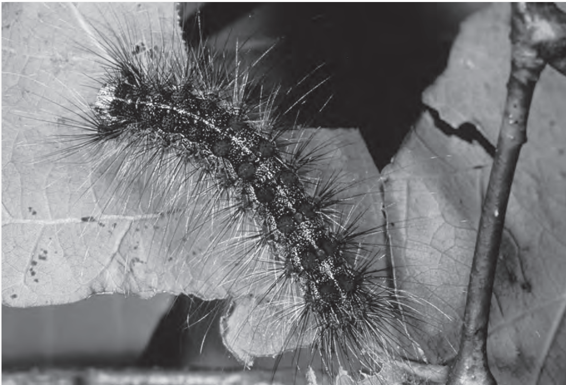
THE GYPSY MOTH CATERPILLAR IS A NONNATIVE SPECIES.