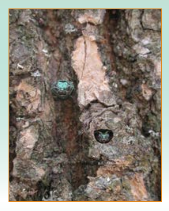
Figure 3. Emerald ash borer is a beetle native to Asia. Since its arrival in the United States, the beetle has caused problems for white ash trees.