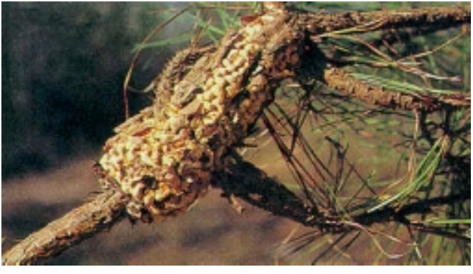
A fusiform rust gall on a branch.