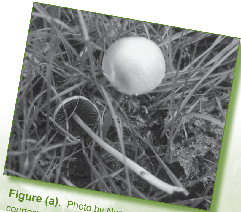
Figure (a).

Now, using your mushroom drawing as a guide, identify the parts of mushrooms in the photographs. Compare the mushrooms. What are two similarities between all mushroom species? What are two differences between some mushroom species?