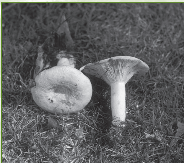
Figure (b).