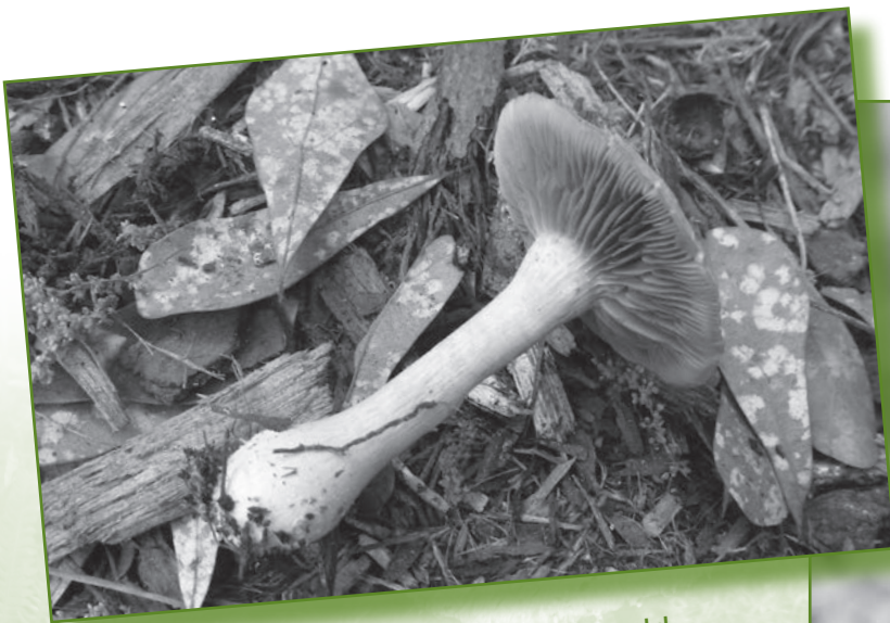
Figure (e).