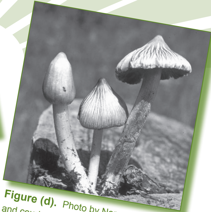
Figure (d).